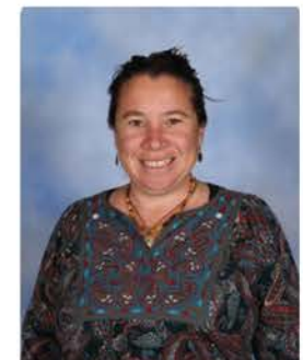
Skye Bradford Preschool