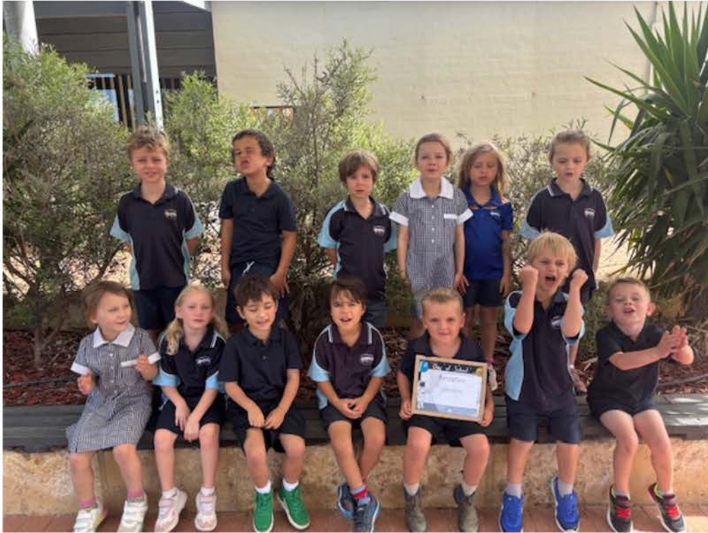
Welcome to the new Receptions!