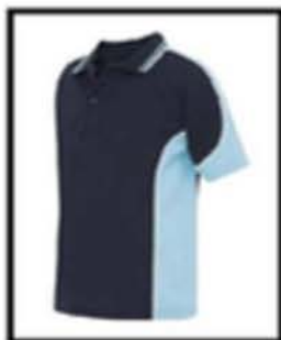
Duffield Polo Shirt

We are now stocking school uniform items on site. Purchases can be made from the school front office, orders are to be prepaid. Depending on demand, orders will be placed twice a term. Please return the order below to the front office.