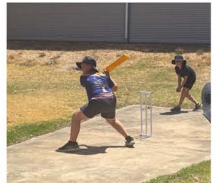
Ashes match in full flight