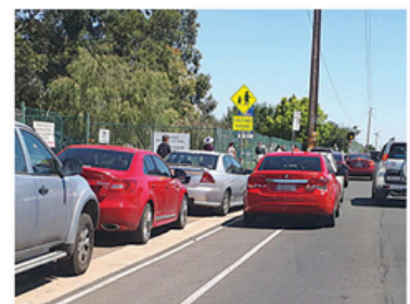
Example of cars double parked in a school zone.

This practice is illegal and creates dangerous situations for traffic flow and for pedestrians crossing a road.