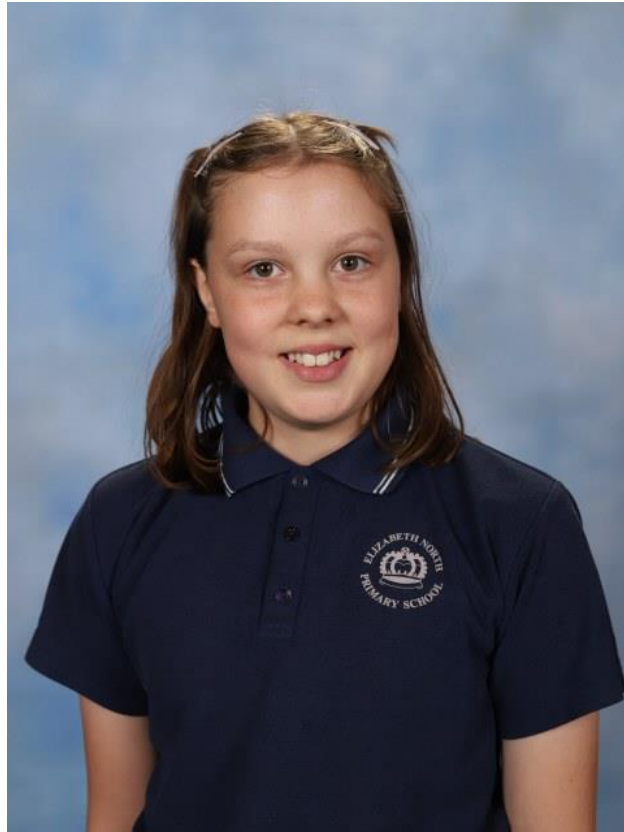
17 - Sapphire Rm 21