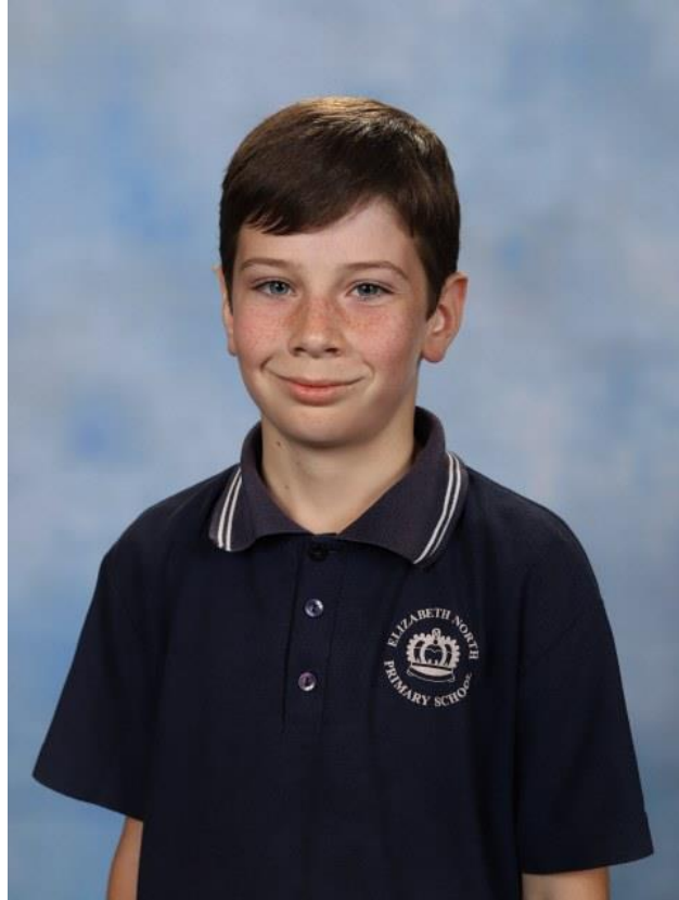
19 - Lakeyn Rm 22