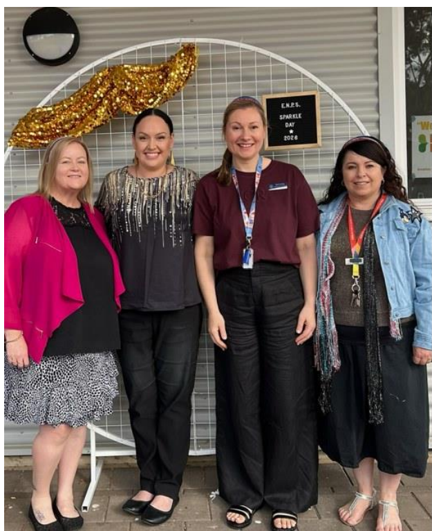
14 - Admin Team