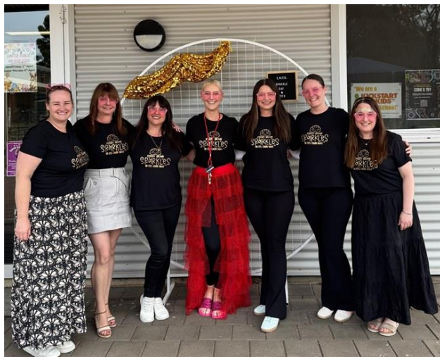
13 - Leadership Team