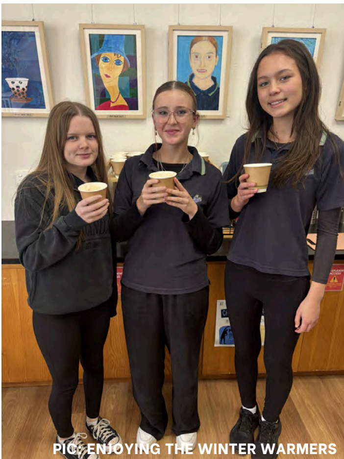
PICTURE: ENJOYING THE WINTER WARMERS

Each Wednesday at lunchtime, students can enjoy a free warm bowl of homemade soup from the Student Hub – a great way to stay warm, connected, and well-fed during winter. So far this term, students have enjoyed delicious favourites including potato, leek and bacon soup, pea and ham soup, and Thai pumpkin soup.