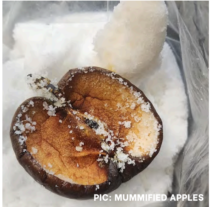
PIC: MUMMIFIED APPLES

Year 8 students also recently participated in the Australian Geography Competition. This nationwide competition challenges students' geographical knowledge and skills, including map reading, environmental understanding, global issues, and spatial thinking. Congratulations to all students who took part. We will be advised of the results soon.