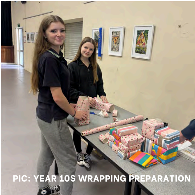
PIC: YEAR 10S WRAPPING PREPARATION

The success of the event highlighted the power of student leadership, teamwork, and community spirit. Most importantly, it reminded us that celebrations like Mother's Day are about recognising care, support, and connection in all its forms. We look forward to making the Mother's Day Stall a special tradition in the years to come.