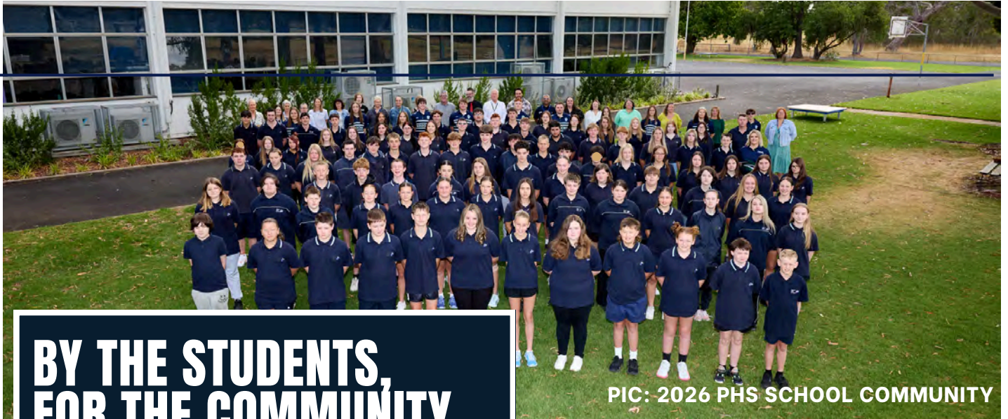
PIC: 2026 PHS SCHOOL COMMUNITY