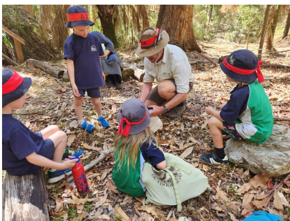
Arbury Park visit