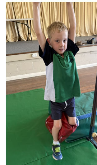
Green logo polo shirt