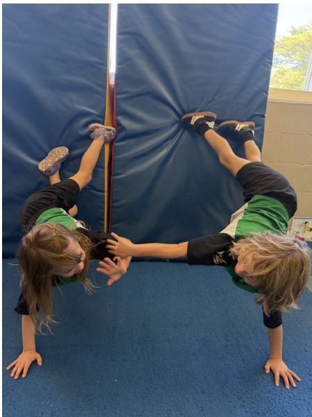
Sporting Schools gymnastics