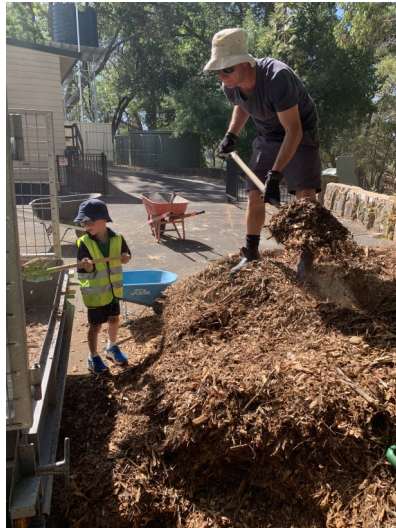
Working bee to spread mulch

We believe that parents/caregivers are a vital part of our school community and welcome participation in our school programs. Parent/ Caregivers have a range of skills and may be involved in classrooms, reading activities, cooking, library, working bees, transport to and from sporting events, excursions, fundraising, social activities, Governing Council, and various committees. Please see Steph in our Front Office for all information relating to documents required to volunteer.