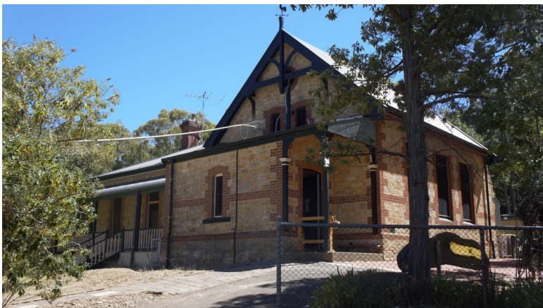
School house built in 1885

At Basket Range Primary School, we are committed to fostering well-rounded individuals who are equipped to thrive in an ever-changing world. We embrace the holistic development of each child's academic, artistic, practical, social and emotional capabilities.