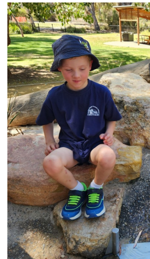
Navy logo T-shirt and bucket hat

We are proud of belonging to our school and therefore it is an expectation that students attending Basket Range Primary School will wear the school uniform. The school colours are green and blue. New and second hand uniforms are available from the front office. As we are an active school spending time exploring our environment, it is important that students come to school with appropriate foot wear.