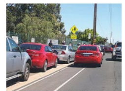
Example of cars double parked in a school zone.

Double Parking Drivers must not stop next to a vehicle already stopped or parked at the kerb at any time. This practice is illegal and creates dangerous situations for traffic flow and for pedestrians crossing a road.